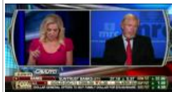
MRC's Bozell Discusses Lack of Coverage For Dem. Scandals vs. GOP Scandals