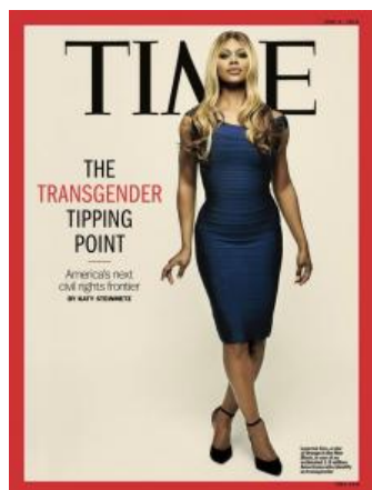
Time magazine, June 9, 2014, cover story, The Transgender Tipping Point: America's Next Civil Rights Frontier."

The former Johns Hopkins chief of psychiatry also warned against enabling or encouraging certain subgroups of the transgendered, such as young people "susceptible to suggestion from 'everything is normal' sex education," and the schools' "diversity counselors" who, like "cult leaders," may "encourage these young people to distance themselves from their families and offer advice on rebutting