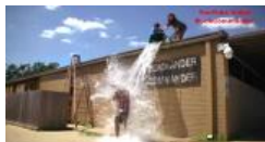
Duck Dynasty's Willie Robertson Takes Ice Bucket Challenge to Raise Money for ALS Research